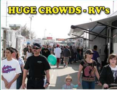
HUGE CROWDS - RV's