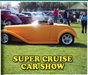
SUPER CRUISE CAR SHOW