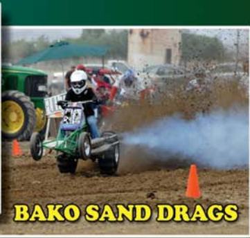
BAKO SAND DRAGS