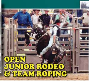
OPEN JUNIOR RODEO & TEAM ROPING